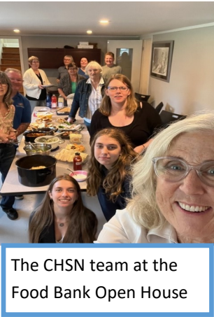
The CHSN team at the Food Bank Open House